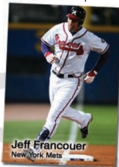
Jeff Francouer New York Mets