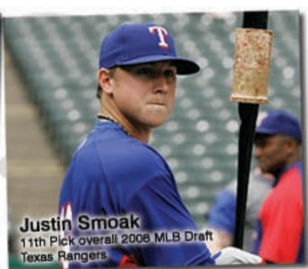
Justin Smoak 11th Pick overall 2008 MLB Draft Texas Rangers